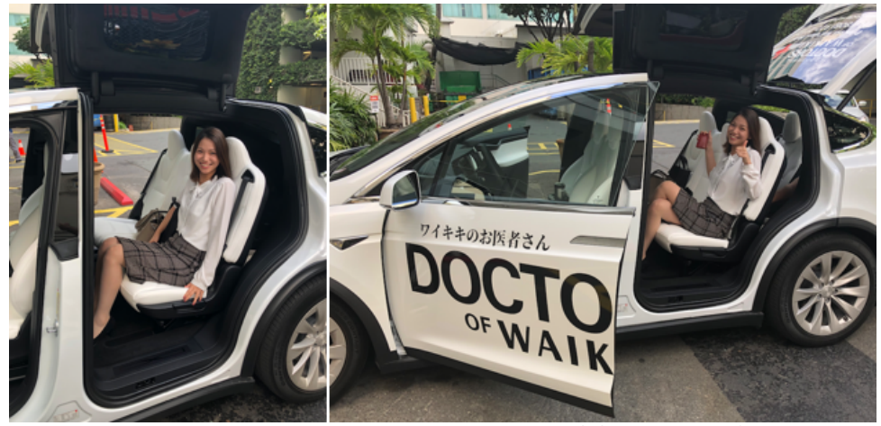
Courtesy complimentary transportation service between Waikiki hotels to/from Doctors of Waikiki

Doctors of Waikiki is the largest and most fully staffed Urgent Care in Waikiki. 90% of all employees (nurses, other medical staff, client service representatives, reception, administration and others) are qualified and experienced (bilingual) English, Japanese, Chinese & Korean speaking. They will offer courtesy complimentary transportation service between Waikiki hotels to/from Doctors of Waikiki as well as provide House/Hotel room calls in Waikiki and shall be the only Urgent Care in Waikiki open until midnight daily. "We both have decided to sacrifice our personal time and stay open until midnight daily to provide Urgent Care services currently not available but needed in Waikiki during late night hours. Hopefully our Urgent Care services can also decrease the burden of non-emergency visits to the ER coming from patients coming from Waikiki," says Dr. Alan Wu and Dr. Tony T. of Doctors of Waikiki.