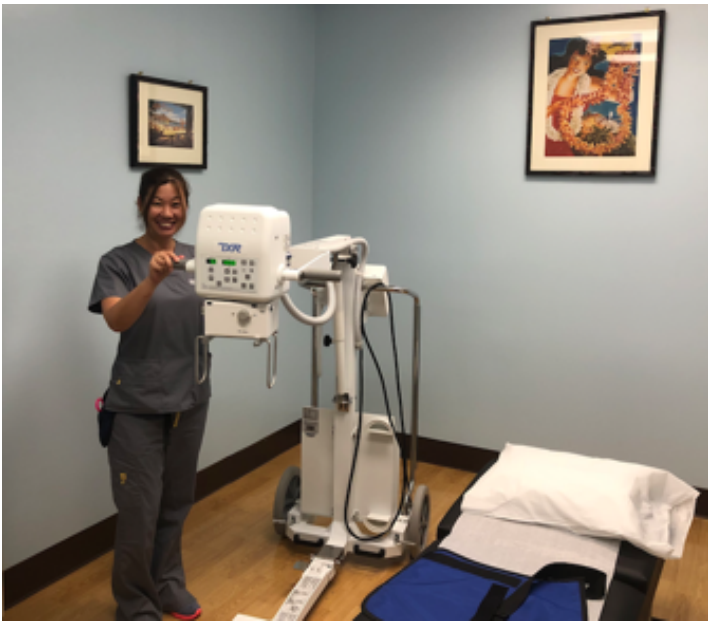
Digital x-ray (offering immediate results)