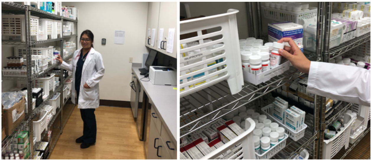
In-house pharmaceutical dispensary