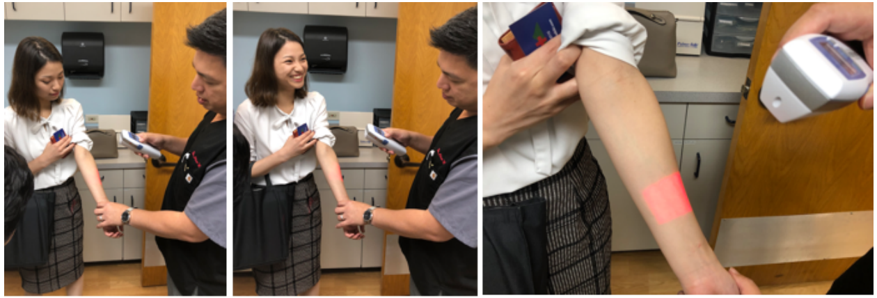
State-of-the-art vein finder (vein illuminator) for patient satisfaction

"Doctors of Waikiki" opened the largest, most advanced Urgent Care in the State of Hawaii on December 1, 2018 at the Sheraton Princess Ka'iulani Hotel in Waikiki located on the ground floor at 120 Ka'iulani Avenue. The new 5,000 square foot location has the newest state-of-the-art technology with vein finder, digital x-ray (offering immediate results), in-house lab with results in 15 minutes (for blood chemistry, blood count, liver, lipids, urinalysis, influenza, rsv, strep and many more), in-house pharmaceutical dispensary, IV (intravenous therapy) for normal hydration, multi-vitamin infusion, detox, anti-aging and immune boost IV.