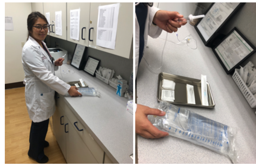
IV (intravenous therapy) for normal hydration, multi-vitamin infusion, detox, anti-aging and immune boost IV