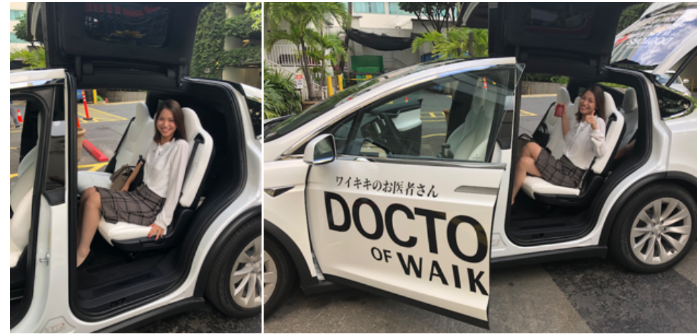
Courtesy complimentary transportation service between Waikiki hotels to/from Doctors of Waikiki

Doctors of Waikiki is the largest and most fully staffed Urgent Care in Waikiki. 90% of all employees (nurses, other medical staff, client service representatives, reception, administration and others) are qualified and experienced (bilingual) English, Japanese, Chinese & Korean speaking. They will offer courtesy complimentary transportation service between Waikiki hotels to/from Doctors of Waikiki as well as provide House/Hotel room calls in Waikiki and shall be <u>the only Urgent Care in Waikiki</u> <u>open until midnight daily</u>. "We both have decided to sacrifice our personal time and stay open until midnight daily to provide Urgent Care services currently not available but needed in Waikiki during late night hours. Hopefully our Urgent Care services can also decrease the burden of non-emergency visits to the ER coming from patients coming from Waikiki," says Dr. Alan Wu and Dr. Tony T. of Doctors of Waikiki.