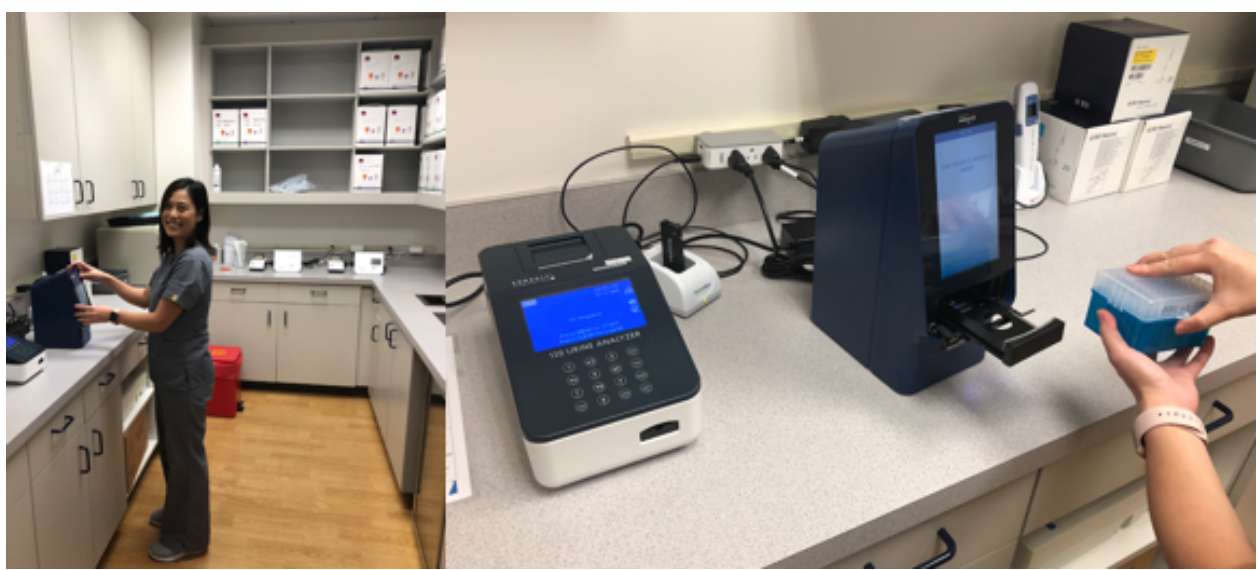
In-house lab with results in 15 minutes (for blood chemistry, blood count, liver, lipids, urinalysis, influenza, rsv, strep and many more)