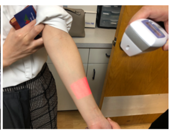
State-of-the-art vein finder (vein illuminator) for patient satisfaction