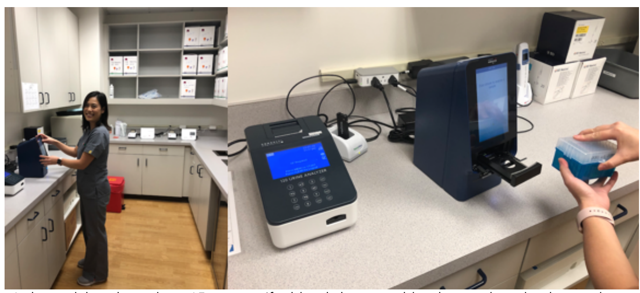
In-house lab with results in 15 minutes (for blood chemistry, blood count, liver, lipids, urinalysis, influenza, rsv, strep and many more)