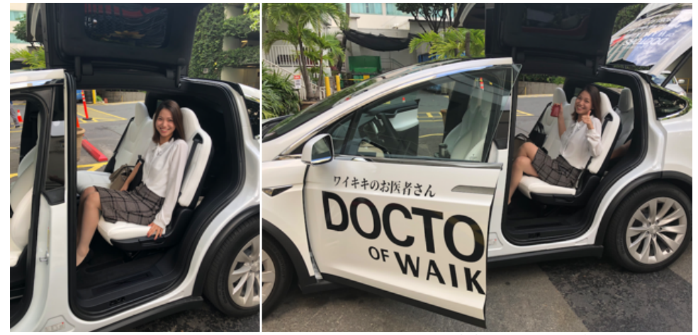
Courtesy complimentary transportation service between Waikiki hotels to/from Doctors of Waikiki

Doctors of Waikiki is the largest and most fully staffed Urgent Care in Waikiki. 90% of all employees (nurses, other medical staff, client service representatives, reception, administration and others) are qualified and experienced (bilingual) English, Japanese, Chinese & Korean speaking. They will offer courtesy complimentary transportation service between Waikiki hotels to/from Doctors of Waikiki as well as provide House/Hotel room calls in Waikiki and shall be the only Urgent Care in Waikiki open until midnight daily. "We both have decided to sacrifice our personal time and stay open until midnight daily to provide Urgent Care services currently not available but needed in Waikiki during late night hours. Hopefully our Urgent Care services can also decrease the burden of non-emergency visits to the ER coming from patients coming from Waikiki," says Dr. Alan Wu and Dr. Tony T. of Doctors of Waikiki.