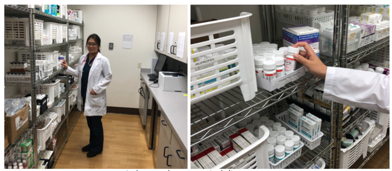
In-house pharmaceutical dispensary