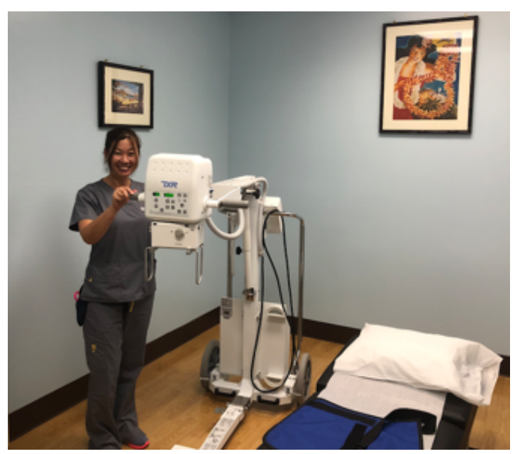
Digital x-ray (offering immediate results)