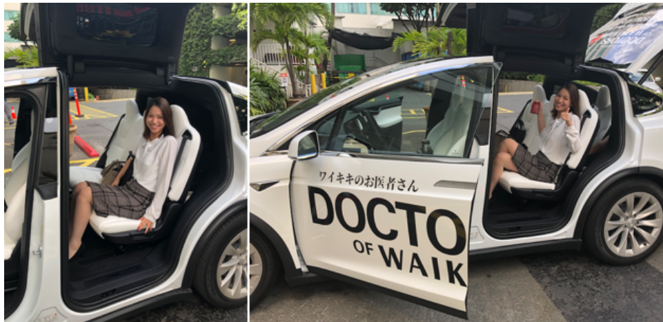
Courtesy complimentary transportation service between Waikiki hotels to/from Doctors of Waikiki

Doctors of Waikiki is the largest and most fully staffed Urgent Care in Waikiki. 90% of all employees (nurses, other medical staff, client service representatives, reception, administration and others) are qualified and experienced (bilingual) English, Japanese, Chinese, Korean, Spanish, French and Slavic speaking. They will offer courtesy complimentary transportation service between Waikiki hotels to/from Doctors of Waikiki as well as provide House/Hotel room calls in Waikiki and shall be the only Urgent Care in Waikiki open until midnight daily . "We both have decided to sacrifice our personal time and stay open until midnight daily to provide Urgent Care services currently not available but needed in Waikiki during late night hours. Hopefully our Urgent Care services can also decrease the burden of non-emergency visits to the ER coming from patients coming from Waikiki," says Dr. Alan Wu and Dr. Tony T. of Doctors of Waikiki.