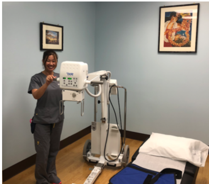
Digital x-ray (offering immediate results)