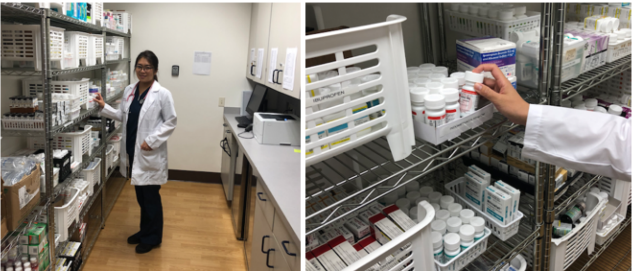
In-house pharmaceutical dispensary