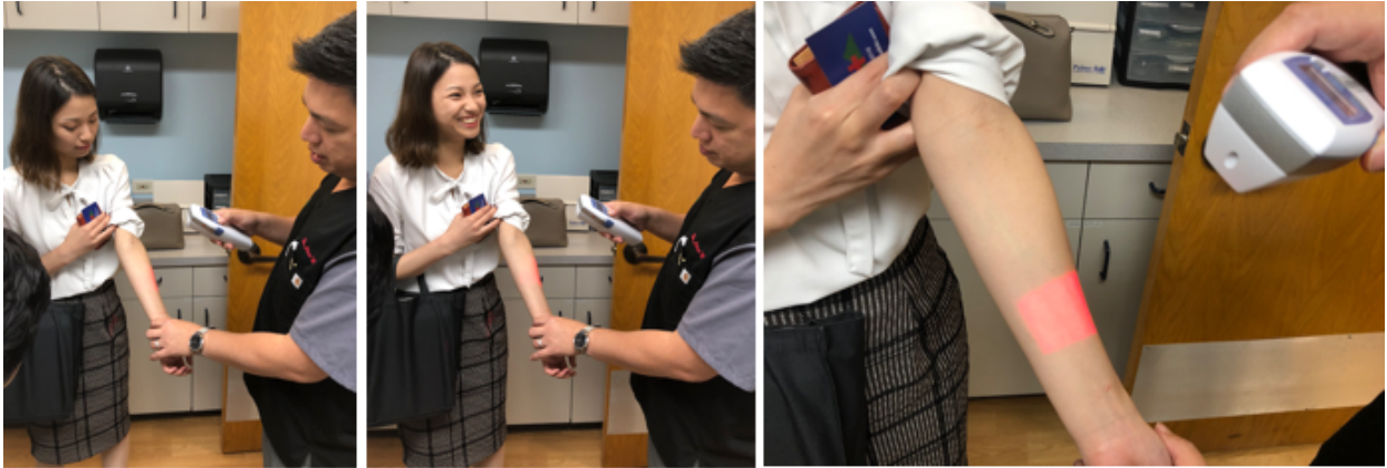
State-of-the-art vein finder (vein illuminator) for patient satisfaction

"Doctors of Waikiki" opened the largest, most advanced Urgent Care in the State of Hawaii on December 1, 2018 at the Sheraton Princess Ka'iulani Hotel in Waikiki located on the ground floor at 120 Ka'iulani Avenue. The new 5,000 square foot location has the newest state-of-the-art technology with vein finder, digital x-ray (offering immediate results), in-house lab with results in 15 minutes (for blood chemistry, blood count, liver, lipids, urinalysis, influenza, rsv, strep and many more), in-house pharmaceutical dispensary, IV (intravenous therapy) for normal hydration, multi-vitamin infusion, detox, anti-aging and immune boost IV.