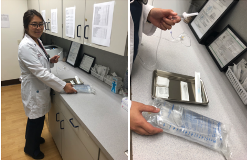
IV (intravenous therapy) for normal hydration, multi-vitamin infusion, detox, anti-aging and immune boost IV