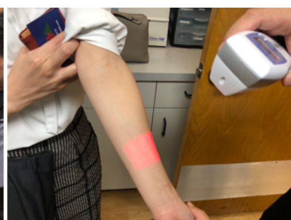
State-of-the-art vein finder (vein illuminator) for patient satisfaction