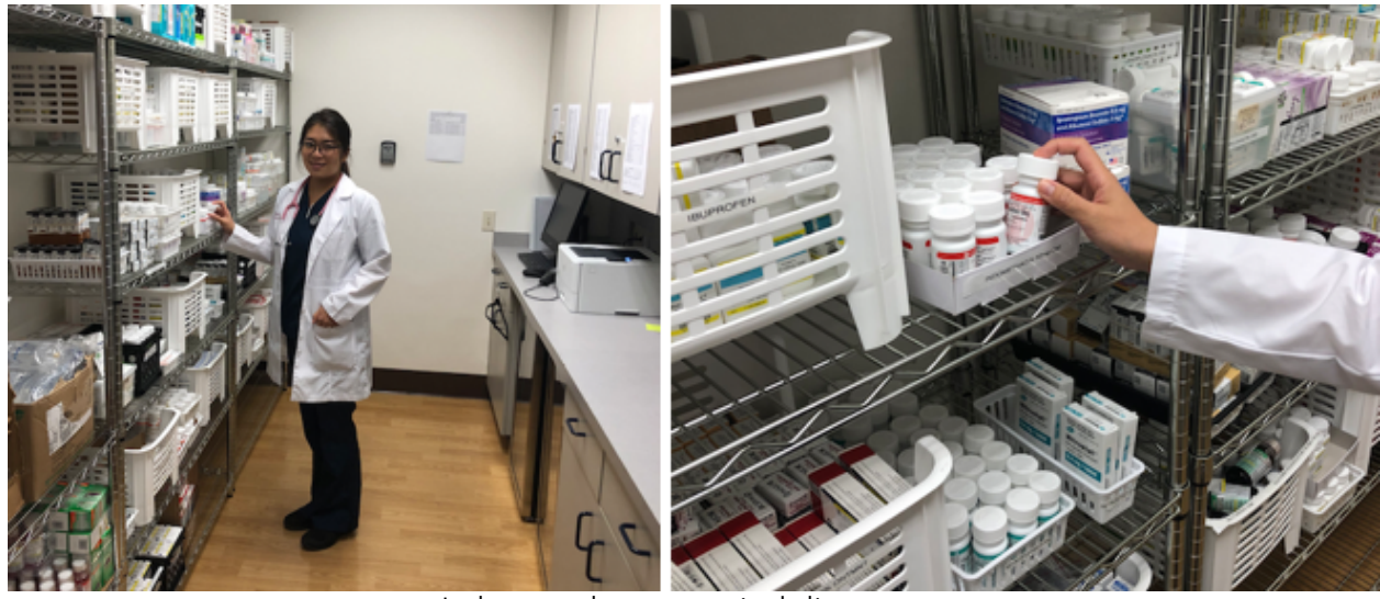
In-house pharmaceutical dispensary