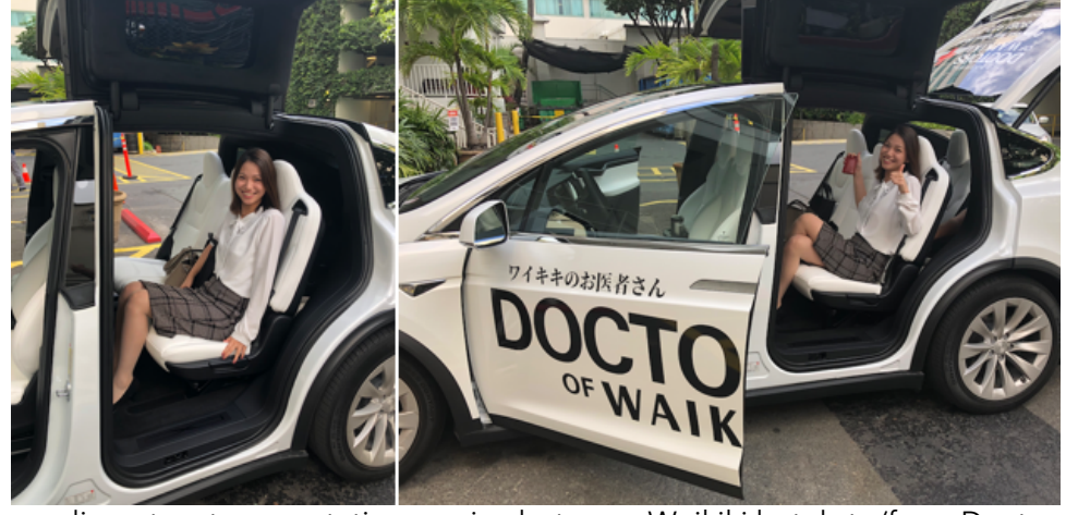
Courtesy complimentary transportation service between Waikiki hotels to/from Doctors of Waikiki

Doctors of Waikiki is the largest and most fully staffed Urgent Care in Waikiki. 90% of all employees (nurses, other medical staff, client service representatives, reception, administration and others) are qualified and experienced (bilingual) English, Japanese, Chinese & Korean speaking. They will offer courtesy complimentary transportation service between Waikiki hotels to/from Doctors of Waikiki as well as provide House/Hotel room calls in Waikiki and shall be the only Urgent Care in Waikiki open until midnight daily. "We both have decided to sacrifice our personal time and stay open until midnight daily to provide Urgent Care services currently not available but needed in Waikiki during late night hours. Hopefully our Urgent Care services can also decrease the burden of non-emergency visits to the ER coming from patients coming from Waikiki," says Dr. Alan Wu and Dr. Tony T. of Doctors of Waikiki.