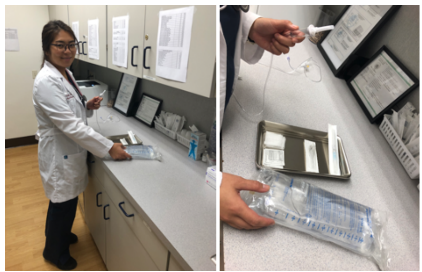
IV (intravenous therapy) for normal hydration, multi-vitamin infusion, detox, anti-aging and immune boost IV