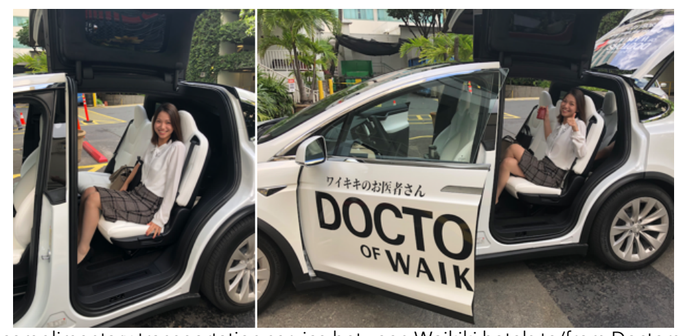
Courtesy complimentary transportation service between Waikiki hotels to/from Doctors of Waikiki

Doctors of Waikiki is the largest and most fully staffed Urgent Care in Waikiki. 90% of all employees (nurses, other medical staff, client service representatives, reception, administration and others) are qualified and experienced (bilingual) English, Japanese, Chinese & Korean speaking. They will offer courtesy complimentary transportation service between Waikiki hotels to/from Doctors of Waikiki as well as provide House/Hotel room calls in Waikiki and shall be <a href="the only Urgent Care">the only Urgent Care</a> in Waikiki open until midnight daily. "We both have decided to sacrifice our personal time and stay open until midnight daily to provide Urgent Care services currently not available but needed in Waikiki during late night hours. Hopefully our Urgent Care services can also decrease the burden of non-emergency visits to the ER coming from patients coming from Waikiki," says Dr. Alan Wu and Dr. Tony T. of Doctors of Waikiki.