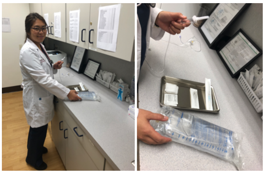
IV (intravenous therapy) for normal hydration, multi-vitamin infusion, detox, anti-aging and immune boost IV