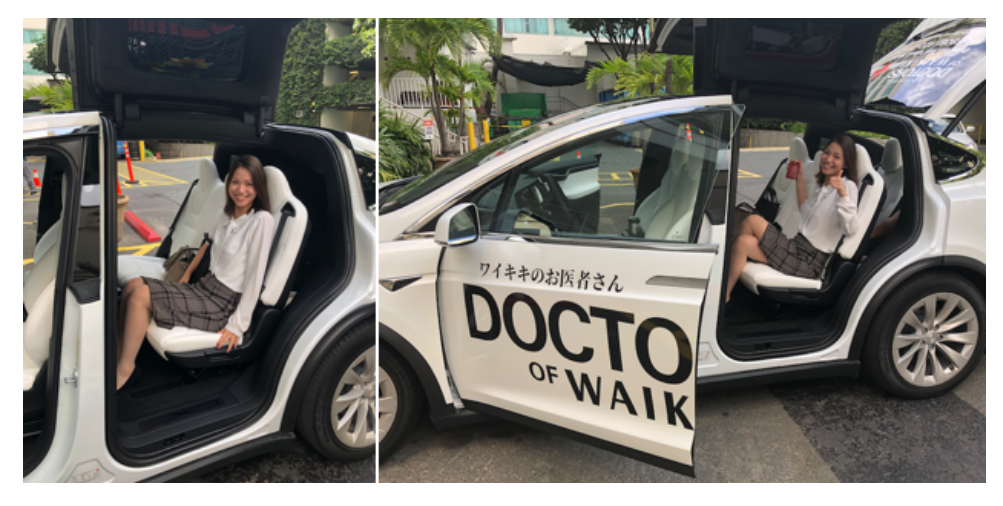
Courtesy complimentary transportation service between Waikiki hotels to/from Doctors of Waikiki