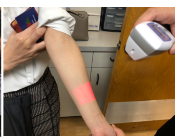
State-of-the-art vein finder (vein illuminator) for patient satisfaction