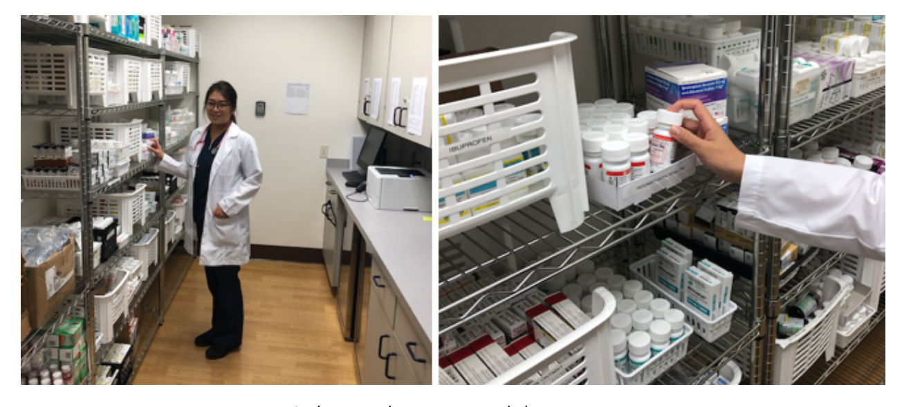
In-house pharmaceutical dispensary