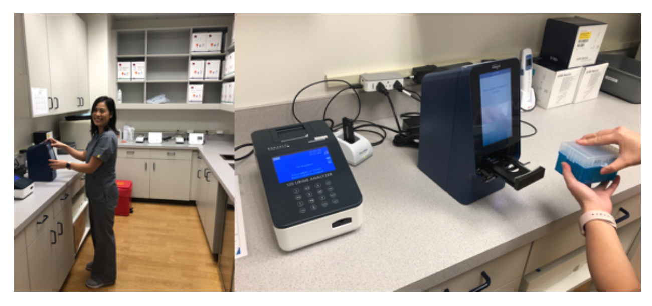
In-house lab with results in 15 minutes (for blood chemistry, blood count, liver, lipids, urinalysis, influenza, rsv, strep and many more)