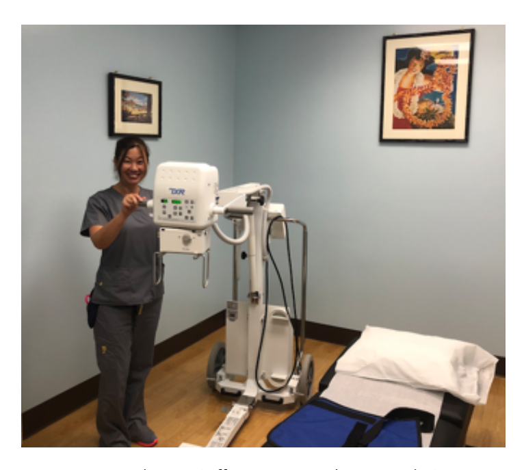
Digital x-ray (offering immediate results)