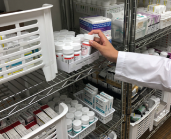
In-house pharmaceutical dispensary