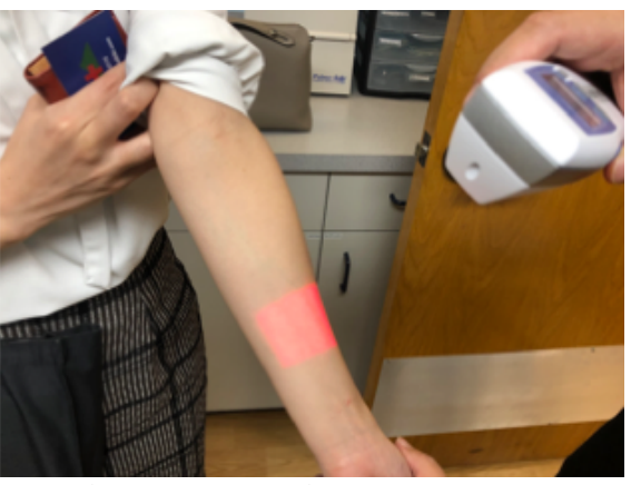
State-of-the-art vein finder (vein illuminator) for patient satisfaction