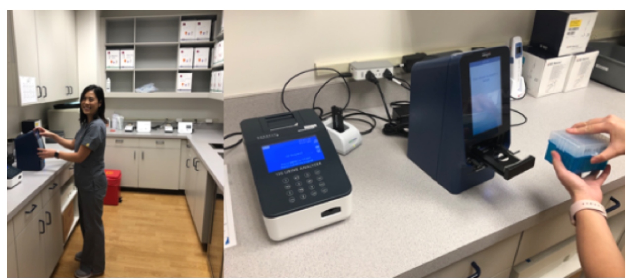
In-house lab with results in 15 minutes (for blood chemistry, blood count, liver, lipids, urinalysis, influenza, rsv, strep and many more)

The new 5,000 square foot location has the newest state-of-the-art technology with vein finder, digital x-ray (offering immediate results), in-house lab with results in 15 minutes (for blood chemistry, blood count, liver, lipids, urinalysis, influenza, rsv, strep and many more), in-house pharmaceutical dispensary, IV (intravenous therapy) for normal hydration, multi-vitamin infusion, detox, anti-aging and immune boost IV.