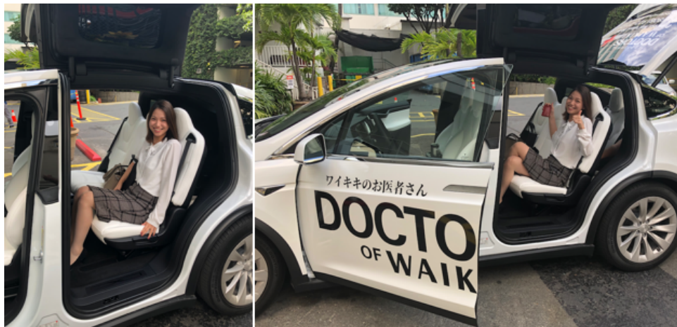
Courtesy complimentary transportation service between Waikiki hotels to/from Doctors of Waikiki

Doctors of Waikiki is the largest and most fully staffed Urgent Care in Waikiki. 90% of all employees (nurses, other medical staff, client service representatives, reception, administration and others) are qualified and experienced (bilingual) English, Japanese, Chinese & Korean speaking. They will offer courtesy complimentary transportation service between Waikiki hotels to/from Doctors of Waikiki as well as provide House/Hotel room calls in Waikiki and shall be the only Urgent Care in Waikiki open until midnight daily . "We both have decided to sacrifice our personal time and stay open until midnight daily to provide Urgent Care services currently not available but needed in Waikiki during late night hours. Hopefully our Urgent Care services can also decrease the burden of non-emergency visits to the ER coming from patients coming from Waikiki," says Dr. Alan Wu and Dr. Tony T. of Doctors of Waikiki.