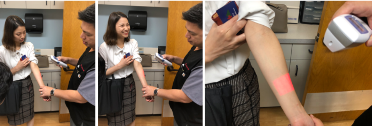
State-of-the-art vein finder (vein illuminator) for patient satisfaction

“Doctors of Waikiki” opened the largest, most advanced Urgent Care in the State of Hawaii on December 1, 2018 at the Sheraton Princess Ka’iulani Hotel in Waikiki located on the ground floor at 120 Ka’iulani Avenue. The new 5,000 square foot location has the newest state-of-the-art technology with vein finder, digital x-ray (offering immediate results), in-house lab with results in 15 minutes (for blood chemistry, blood count, liver, lipids, urinalysis, influenza, rsv, strep and many more), in-house pharmaceutical dispensary, IV (intravenous therapy) for normal hydration, multi-vitamin infusion, detox, anti-aging and immune boost IV.