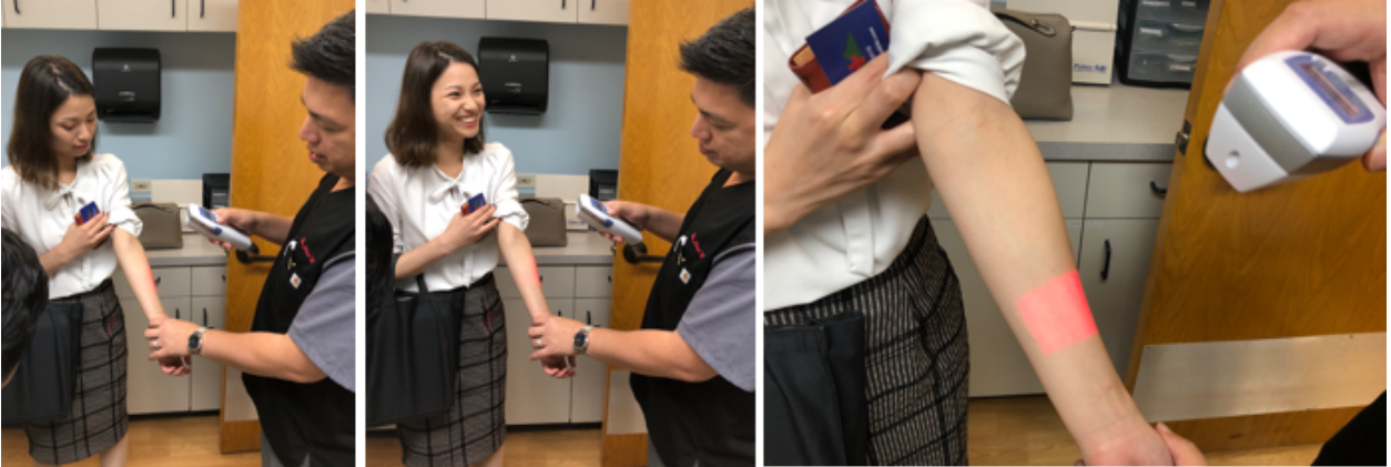
State-of-the-art vein finder (vein illuminator) for patient satisfaction

“Doctors of Waikiki” opened the largest, most advanced Urgent Care in the State of Hawaii on December 1, 2018 at the Sheraton Princess Ka’iulani Hotel in Waikiki located on the ground floor at 120 Ka’iulani Avenue. The new 5,000 square foot location has the newest state-of-the-art technology with vein finder, digital x-ray (offering immediate results), in-house lab with results in 15 minutes (for blood chemistry, blood count, liver, lipids, urinalysis, influenza, rsv, strep and many more), in-house pharmaceutical dispensary, IV (intravenous therapy) for normal hydration, multi-vitamin infusion, detox, anti-aging and immune boost IV.