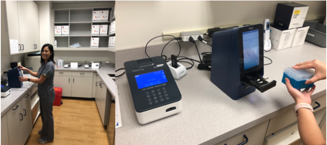
In-house lab with results in 15 minutes (for blood chemistry, blood count, liver, lipids, urinalysis, influenza, rsv, strep and many more)