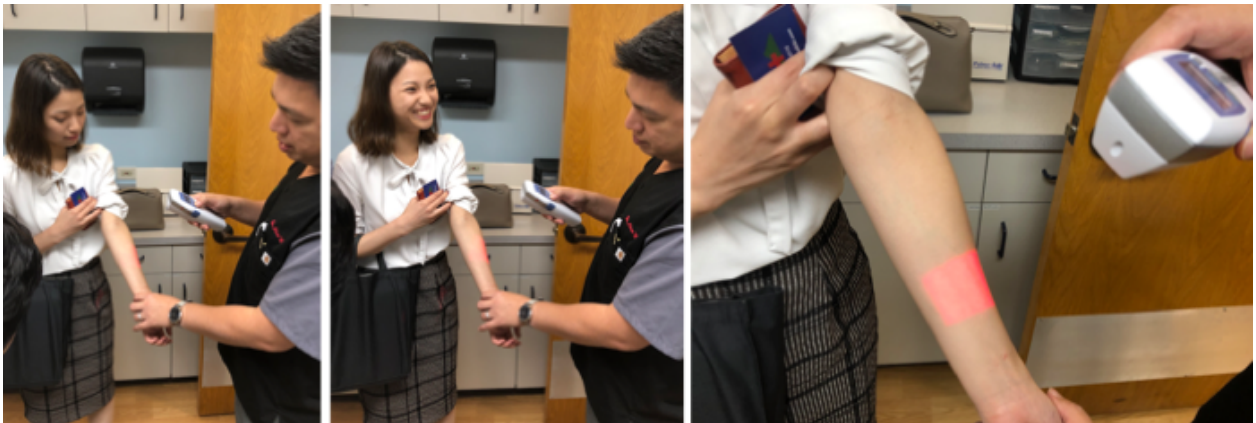
State-of-the-art vein finder (vein illuminator) for patient satisfaction