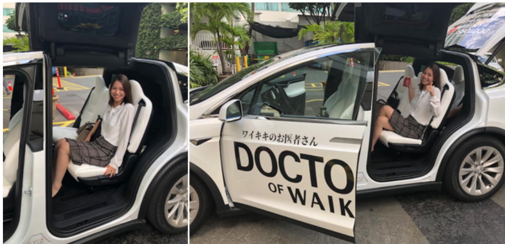
Courtesy complimentary transportation service between Waikiki/Kahala to/from Doctors of Waikiki