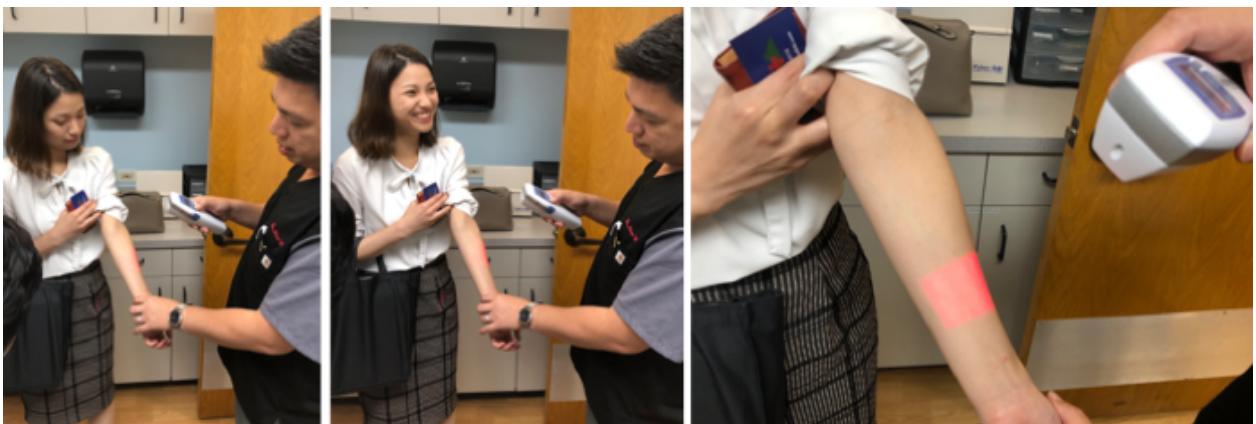
State-of-the-art vein finder (vein illuminator) for patient satisfaction