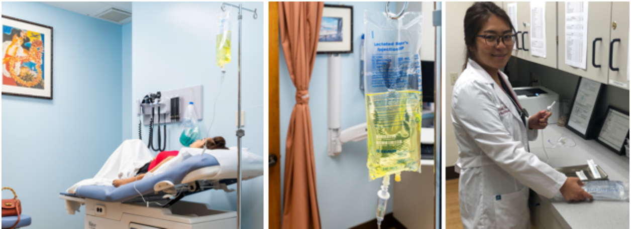
Planning to run a marathon or just finished one?

We also give IVs that revitalize your skin and leave it with a pleasing glow. Ideal treatment for dehydration, jet lag (lethargy), headache & migraine, constipation, illness wellness (cold & flu), hangover & detox, beauty & healthier skin, vitamin, amino acids, magnesium & iron treatment, improving bone mineral density, boost your immune system, digestive health, improved brain function, treat severe asthma, improved sexual function, sports performance (increased energy, muscle recovery and hydration) and proactively maintain overall optimal wellness.